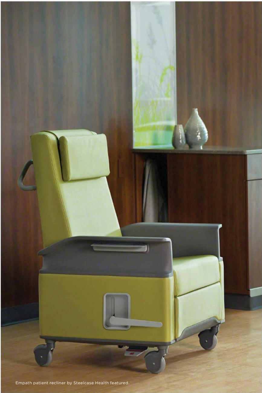
Empath patient recliner by Steelcase Health featured.